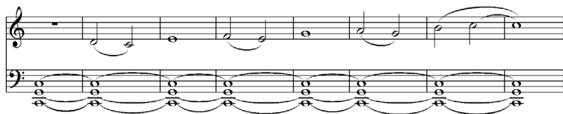
Figure 3 - An 'Alap' Exploring a Diatonic Scale Over a Drone